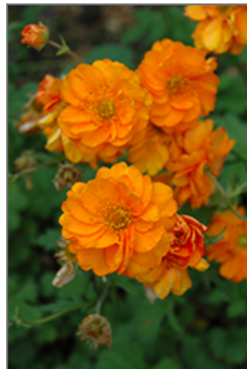
Fire Storm Avens flowers

Fire Storm Avens is recommended for the following landscape applications;