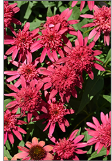
Double Scoop Raspberry Coneflower flowers