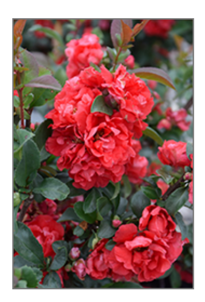
Double Take Pink Flowering Quince flowers