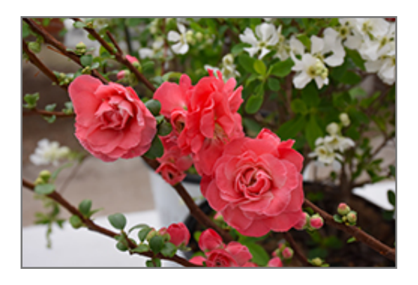
Double Take Pink Flowering Quince flowers

830 W Liberty Dr. Liberty, MO 64068 816.781.0001