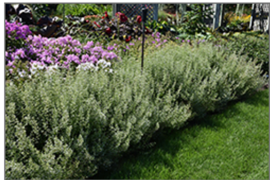
Montrose White Dwarf Calamint in bloom