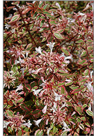
Sunshine Daydream Abelia flowers

Sunshine Daydream Abelia is recommended for the following landscape applications;