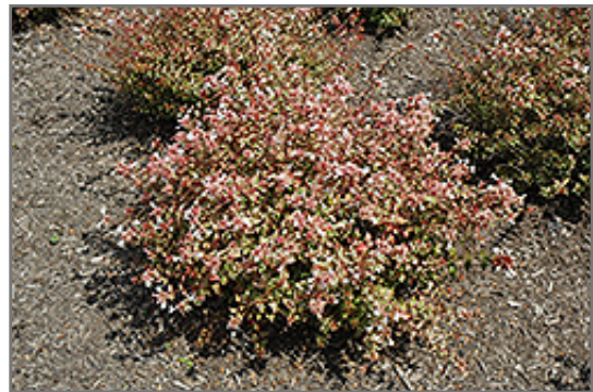
Sunshine Daydream Abelia in bloom