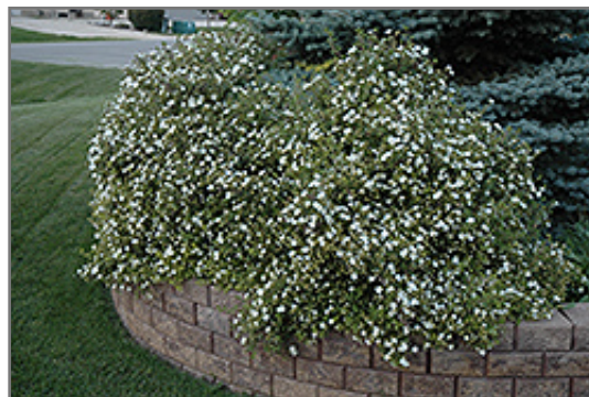
Abbotswood Potentilla in bloom