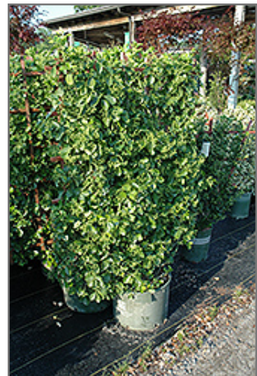
Manhattan Spreading Euonymus