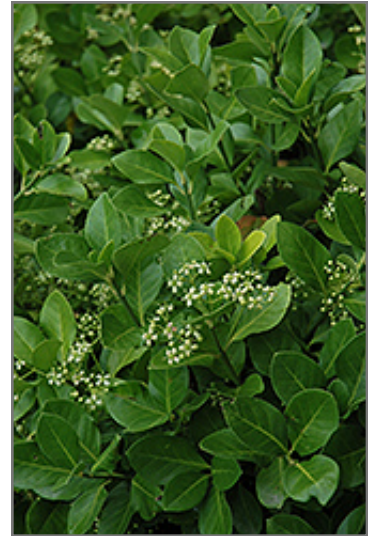
Manhattan Spreading Euonymus flowers

This shrub performs well in both full sun and full shade. It is very adaptable to both dry and moist locations, and should do just fine under average home landscape conditions. It is not particular as to soil type or pH. It is highly tolerant of urban pollution and will even thrive in inner city environments, and will benefit from being planted in a relatively sheltered location. This is a selected variety of a species not originally from North America.