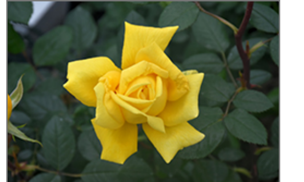
Radiant Perfume Rose flowers

8424 Farley St. Overland Park, KS 66212 913.642.6503