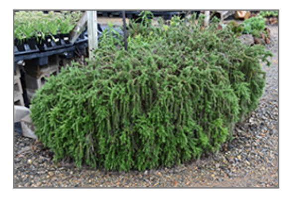
Trailing Rosemary

Trailing Rosemary will grow to be only 6 inches tall at maturity extending to 8 inches tall with the flowers, with a spread of 3 feet. Although it's not a true annual, this plant can be expected to behave as an annual in our climate if left outdoors over the winter, usually needing replacement the following year. As such, gardeners should take into consideration that it will perform differently than it would in its native habitat.