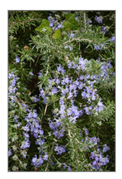
Trailing Rosemary flowers

7036 Nieman Shawnee, KS 66203 913.631.6121