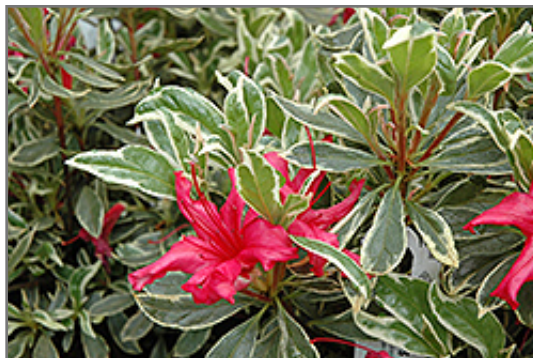
Girard's Variegated Gem Azalea flowers