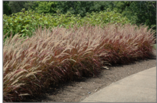
Purple Fountain Grass in bloom

Purple Fountain Grass will grow to be about 4 feet tall at maturity, with a spread of 3 feet. Although it's not a true annual, this plant can be expected to behave as an annual in our climate if left outdoors over the winter, usually needing replacement the following year. As such, gardeners should take into consideration that it will perform differently than it would in its native habitat.