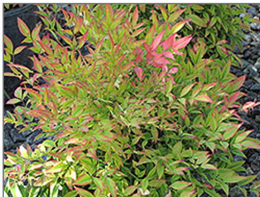
Moon Bay Dwarf Nandina