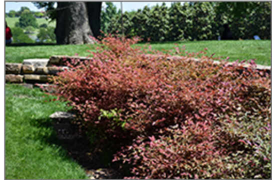
Flirt Nandina

Flirt Nandina is recommended for the following landscape applications;