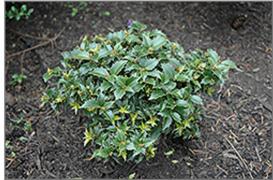
Rock Garden Holly