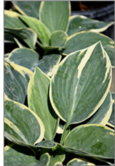
Sugar Daddy Hosta foliage

Sugar Daddy Hosta is recommended for the following landscape applications;