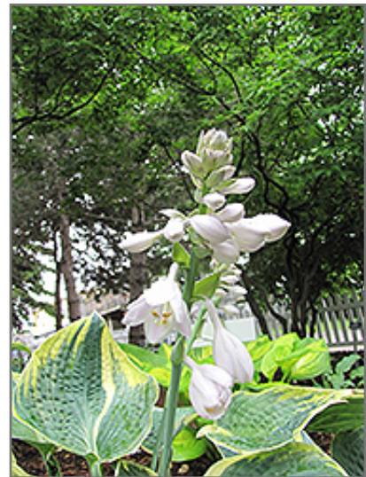
Sugar Daddy Hosta flowers