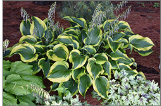
Atlantis Hosta

Atlantis Hosta is recommended for the following landscape applications;