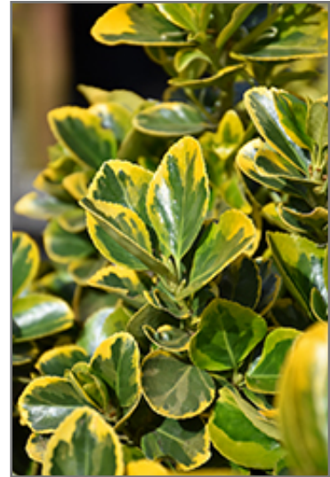
Gold Variegated Japanese Euonymus foliage