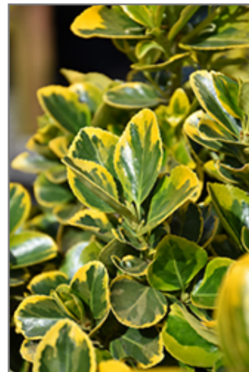
Gold Variegated Japanese Euonymus foliage