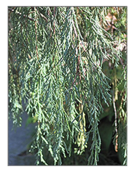
Tolleson's Weeping Juniper foliage

This shrub should only be grown in full sunlight. It is very adaptable to both dry and moist growing conditions, but will not tolerate any standing water. It is considered to be drought-tolerant, and thus makes an ideal choice for xeriscaping or the moisture-conserving landscape. It is not particular as to soil type or pH. It is somewhat tolerant of urban pollution. This is a selection of a native North American species.