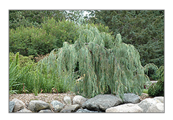
Tolleson's Weeping Juniper

This is a relatively low maintenance shrub, and is best pruned in late winter once the threat of extreme cold has passed. Deer don't particularly care for this plant and will usually leave it alone in favor of tastier treats. It has no significant negative characteristics.