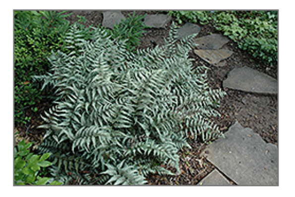
Japanese Painted Fern

Japanese Painted Fern is primarily valued in the garden for its cascading habit of growth. Its attractive ferny bipinnately compound leaves remain grayish green in color with prominent silver tips throughout the season. The dark red stems are very colorful and add to the overall interest of the plant.