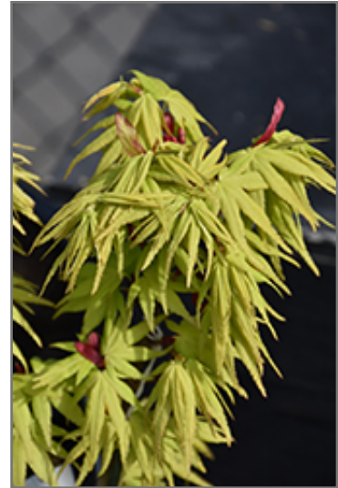
Mikawa Yatsubusa Japanese Maple foliage

Mikawa Yatsubusa Japanese Maple is recommended for the following landscape applications;