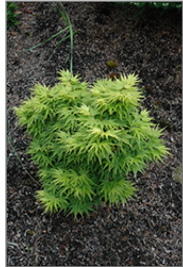
Mikawa Yatsubusa Japanese Maple

Mikawa Yatsubusa Japanese Maple is a fine choice for the yard, but it is also a good selection for planting in outdoor pots and containers. With its upright habit of growth, it is best suited for use as a 'thriller' in the 'spiller-thriller-filler' container combination; plant it near the center of the pot, surrounded by smaller plants and those that spill over the edges. It is even sizeable enough that it can be grown alone in a suitable container. Note that when grown in a container, it may not perform exactly as indicated on the tag - this is to be expected. Also note that when growing plants in outdoor containers and baskets, they may require more frequent waterings than they would in the yard or garden.