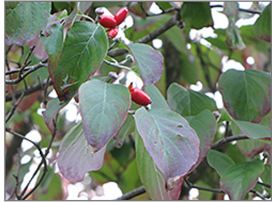
Cherokee Chief Flowering Dogwood fruit

This tree does best in full sun to partial shade. You may want to keep it away from hot, dry locations that receive direct afternoon sun or which get reflected sunlight, such as against the south side of a white wall. It requires an evenly moist well-drained soil for optimal growth, but will die in standing water. It is very fussy about its soil conditions and must have rich, acidic soils to ensure success, and is subject to chlorosis (yellowing) of the foliage in alkaline soils. It is quite intolerant of urban pollution, therefore inner city or urban streetside plantings are best avoided, and will benefit from being planted in a relatively sheltered location. Consider applying a thick mulch around the root zone in winter to protect it in exposed locations or colder microclimates. This is a selection of a native North American species.