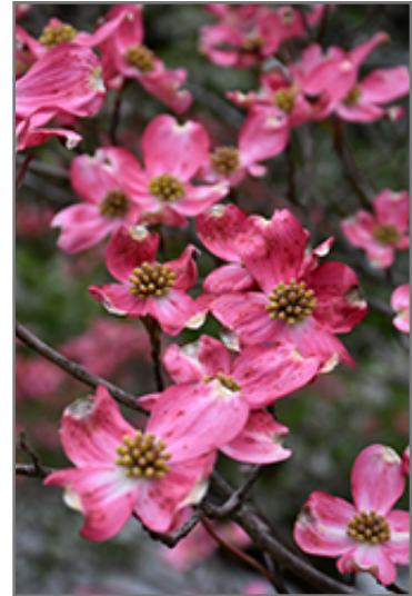
Cherokee Chief Flowering Dogwood flowers

This is a relatively low maintenance tree, and usually looks its best without pruning, although it will tolerate pruning. It is a good choice for attracting birds to your yard. Gardeners should be aware of the following characteristic(s) that may warrant special consideration;