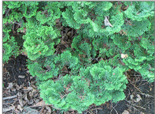
Nana Dwarf Hinoki Falsecypress foliage