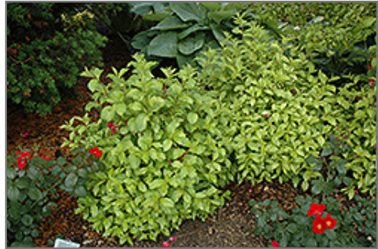
Ghost Weigela

This shrub should only be grown in full sunlight. It prefers to grow in average to moist conditions, and shouldn't be allowed to dry out. It is not particular as to soil type or pH. It is highly tolerant of urban pollution and will even thrive in inner city environments. This is a selected variety of a species not originally from North America.