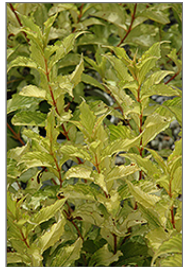
Ghost Weigela foliage