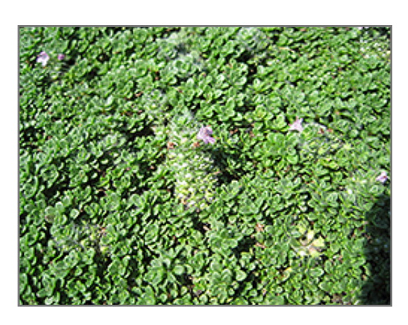
Elfin Creeping Thyme in bloom