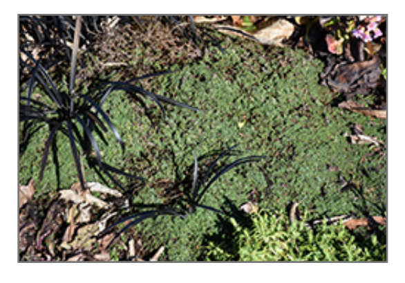
Elfin Creeping Thyme

830 W Liberty Dr. Liberty, MO 64068 816.781.0001