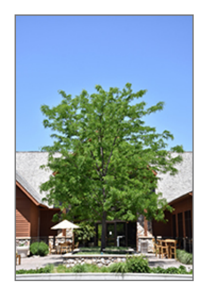
Skyline Honeylocust

830 W Liberty Dr. Liberty, MO 64068 816.781.0001