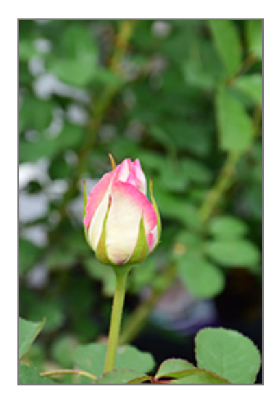
Moonstone Rose flower buds

8424 Farley St. Overland Park, KS 66212 913.642.6503