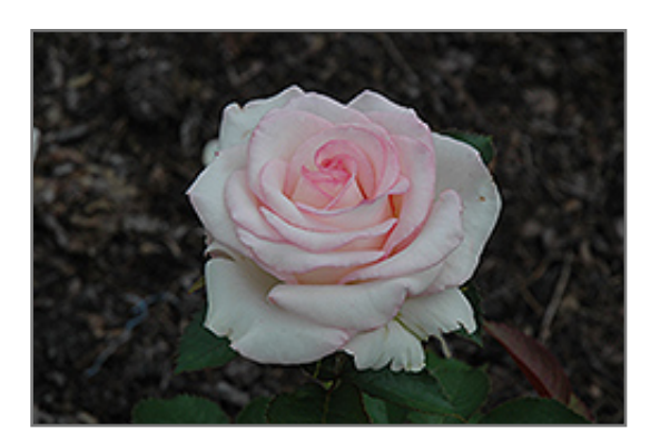
Moonstone Rose flowers

Moonstone Rose is recommended for the following landscape applications;