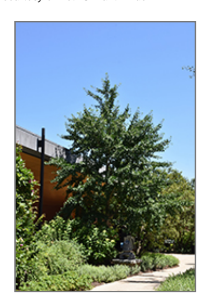
Autumn Gold Ginkgo