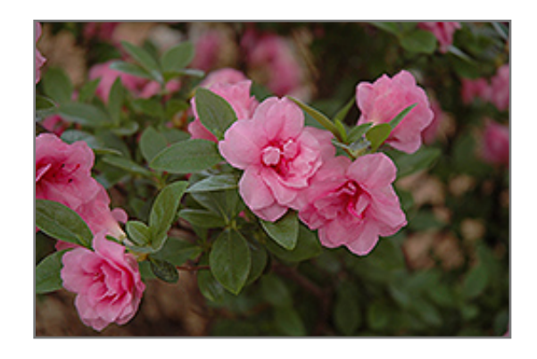
Rosebud Azalea flowers