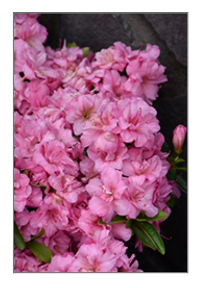
Rosebud Azalea flowers

830 W Liberty Dr. Liberty, MO 64068 816.781.0001