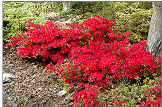
Hino Crimson Azalea in bloom