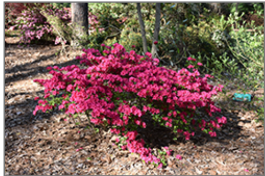
Girard's Fuchsia Evergreen Azalea in bloom