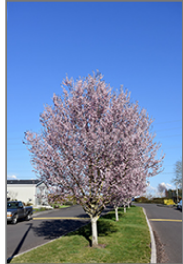
Krauter Vesuvius Plum in bloom