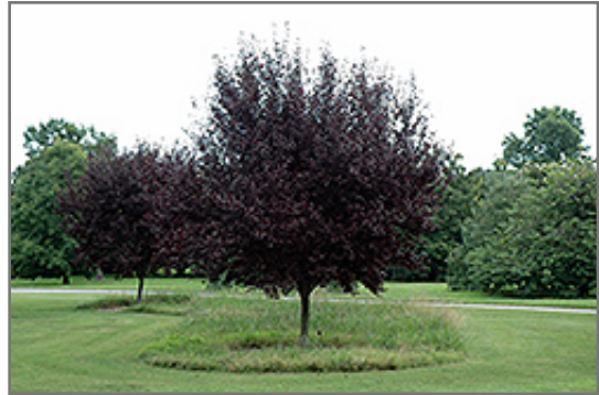
Krauter Vesuvius Plum

This tree should only be grown in full sunlight. It does best in average to evenly moist conditions, but will not tolerate standing water. It is not particular as to soil type or pH. It is highly tolerant of urban pollution and will even thrive in inner city environments. This is a selected variety of a species not originally from North America.