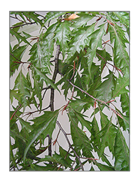
Cutleaf Beech foliage