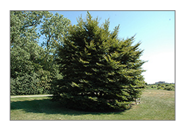
Cutleaf Beech