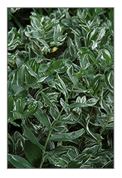
Variegated Solomon's Seal foliage

830 W Liberty Dr. Liberty, MO 64068 816.781.0001