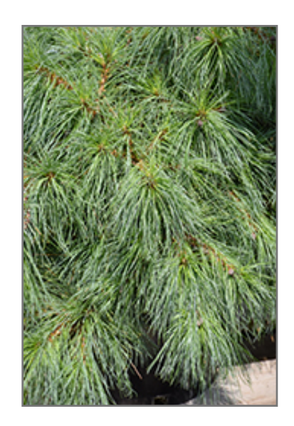
Niagara Falls Eastern White Pine foliage

8424 Farley St. Overland Park, KS 66212 913.642.6503