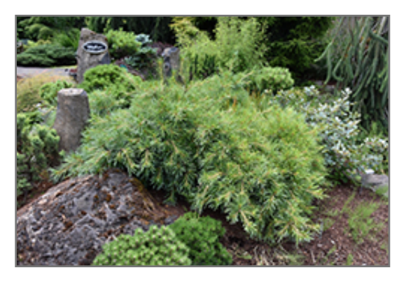
Niagara Falls Eastern White Pine