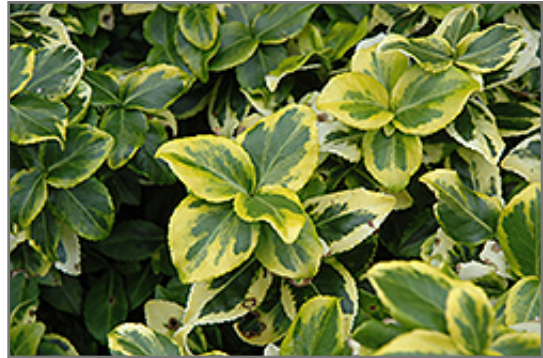
Gold Prince Wintercreeper foliage