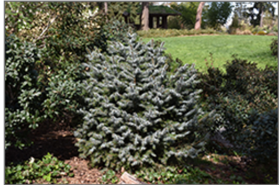
Papoose Dwarf Sitka Spruce