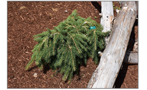
Formanek Norway Spruce

8424 Farley St. Overland Park, KS 66212 913.642.6503