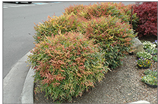
Sienna Sunrise Nandina

Sienna Sunrise Nandina is primarily grown for its highly ornamental fruit. It features an abundance of magnificent red berries from early fall to late winter. It has attractive green evergreen foliage which emerges crimson in spring. The pointy bipinnately compound leaves are highly ornamental and turn an outstanding red in the fall, which persists throughout the winter. It has masses of beautiful panicles of white flowers rising above the foliage from late spring to early summer, which are most effective when planted in groupings. The brick red stems are very effective and add winter interest.