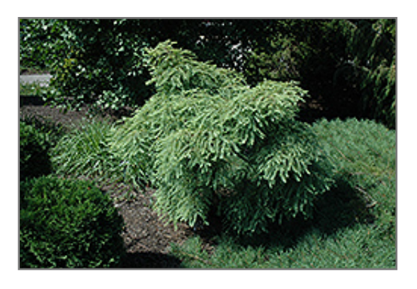
Miss Grace Dawn Redwood

830 W Liberty Dr. Liberty, MO 64068 816.781.0001