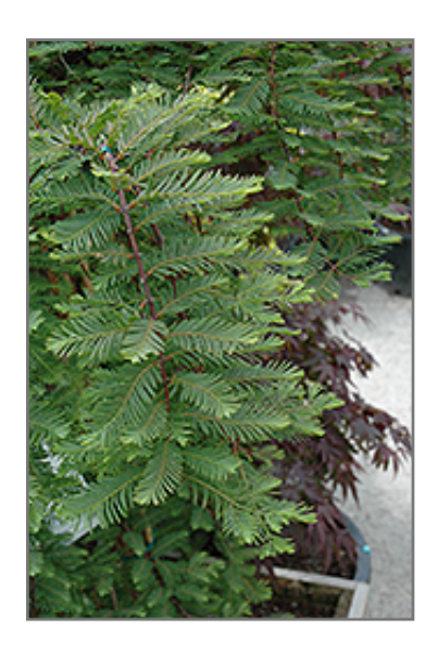
Miss Grace Dawn Redwood foliage