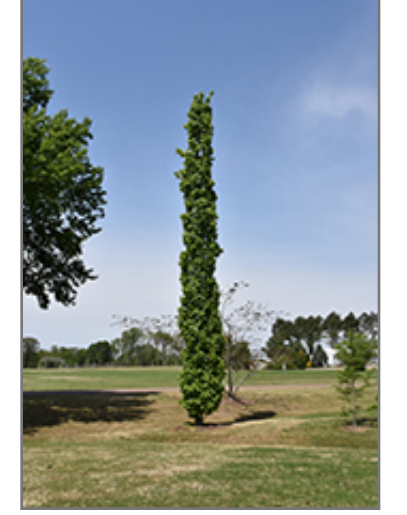
Slender Silhouette Sweet Gum

8424 Farley St. Overland Park, KS 66212 913.642.6503