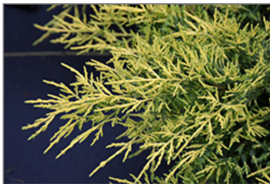
Saybrook Gold Juniper foliage