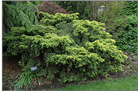
Saybrook Gold Juniper