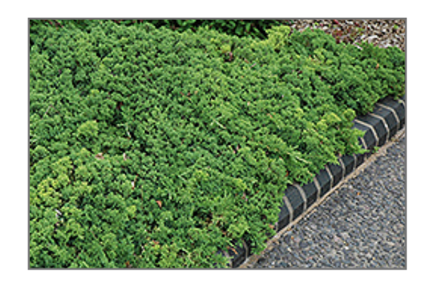
Green Mound Dwarf Japanese Juniper

This is a relatively low maintenance shrub, and is best pruned in late winter once the threat of extreme cold has passed. Deer don't particularly care for this plant and will usually leave it alone in favor of tastier treats. It has no significant negative characteristics.