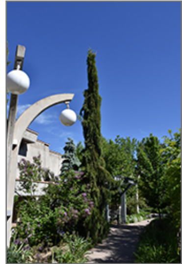
Weeping Giant Sequoia