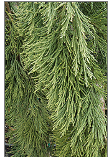
Weeping Giant Sequoia foliage