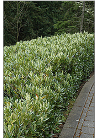
Otto Luyken Dwarf Cherry Laurel in bloom