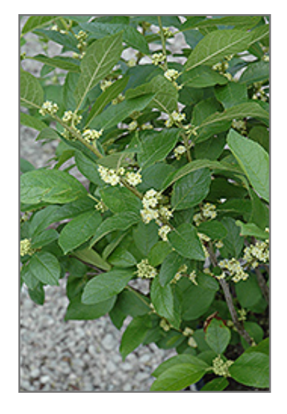
Southern Gentleman Winterberry in bloom

830 W Liberty Dr. Liberty, MO 64068 816.781.0001