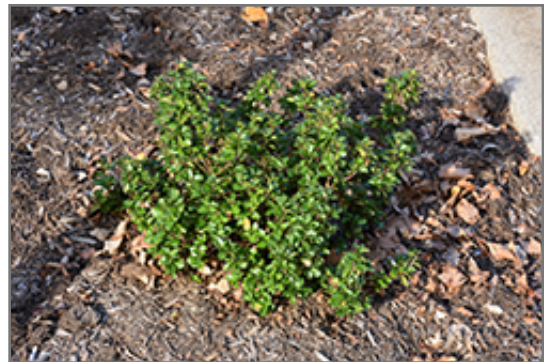
Emerald Magic Meserve Holly