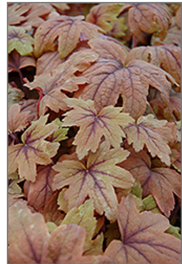
Sweet Tea Foamy Bells foliage