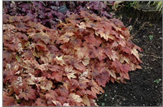
Sweet Tea Foamy Bells

Sweet Tea Foamy Bells will grow to be about 20 inches tall at maturity, with a spread of 28 inches. When grown in masses or used as a bedding plant, individual plants should be spaced approximately 24 inches apart. Its foliage tends to remain dense right to the ground, not requiring facer plants in front. It grows at a medium rate, and under ideal conditions can be expected to live for approximately 10 years. As an evergreen perennial, this plant will typically keep its form and foliage year-round.