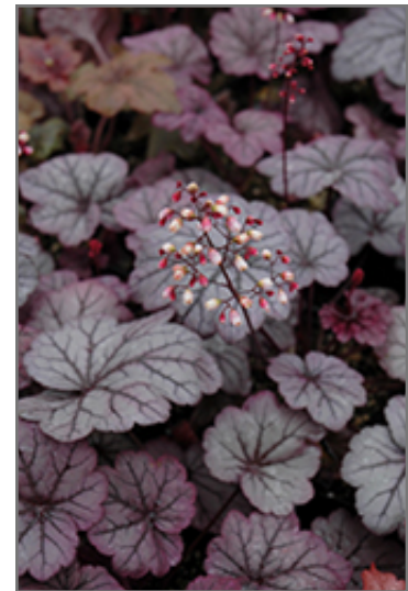
Sugar Plum Coral Bells flowers