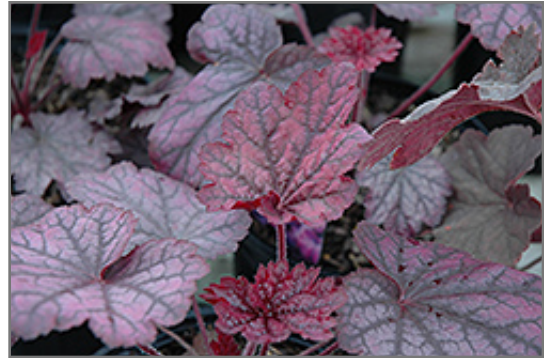
Midnight Bayou Coral Bells foliage

Midnight Bayou Coral Bells is recommended for the following landscape applications;