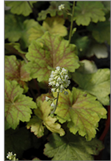
Electra Coral Bells flowers

Electra Coral Bells is recommended for the following landscape applications;